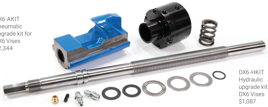
DX6-HKIT Hydraulic upgrade kit for DX6 Vises $1,087