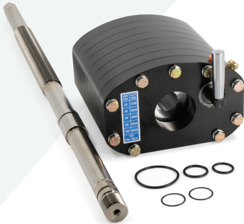
DX6-AKIT Pneumatic upgrade kit for DX6 Vises $2,344